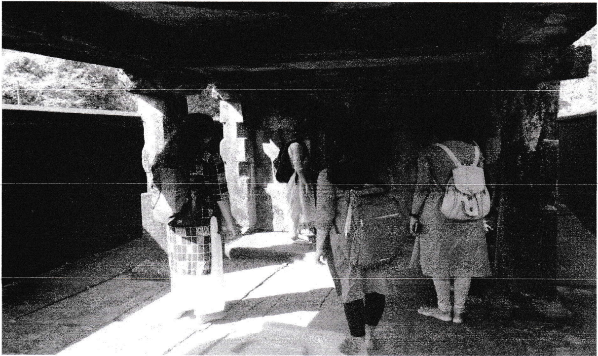
Students observing the architecture of Kattala Basadi