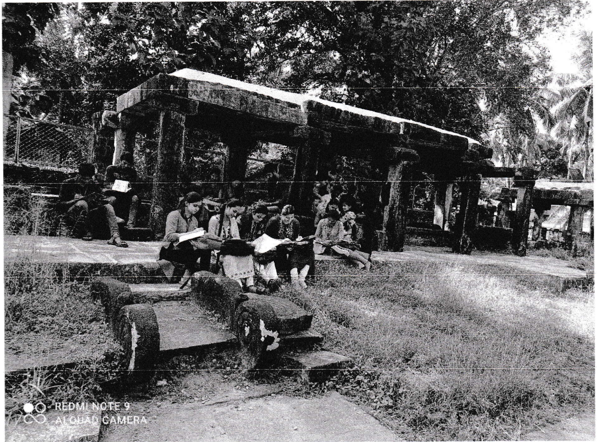
Students involved in creative reading and writing at Kattala Basadi