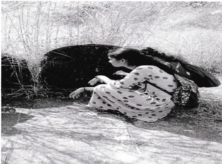
Students observing the inscriptions at Kattala Basadi